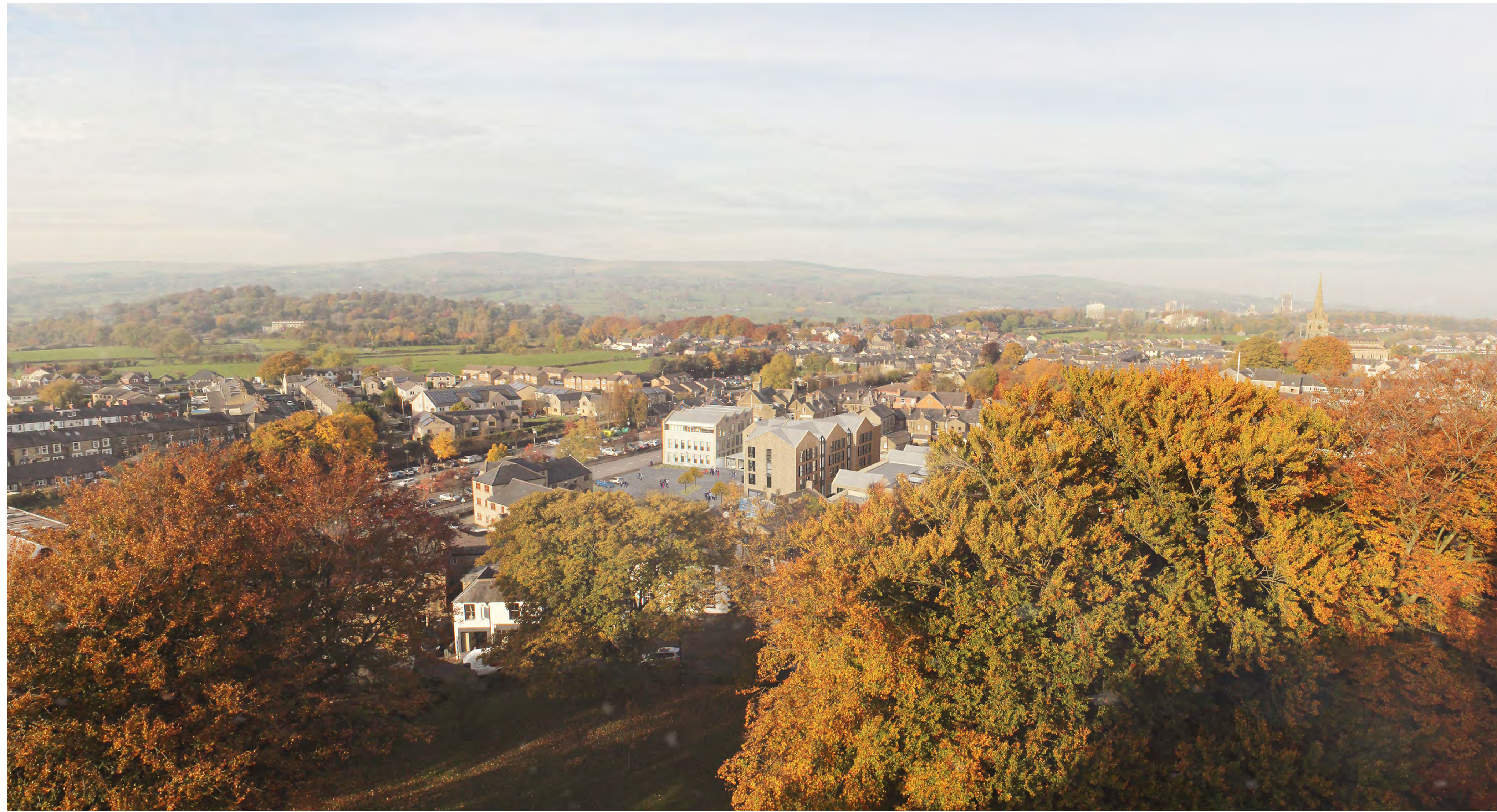
View from Castle

A. To ensure that we get the right scheme for Clitheroe, Ribble Valley Borough Council is undertaking a wide reaching engagement programme prior to detailed plans being brought forward for consideration. Surveys will be available at the council offices and online and will also be sent to town centre businesses, emailed out to citizens' panel members and a postal survey will be sent randomly to 2000 households. This will also be backed up with street interviews around the town centre.