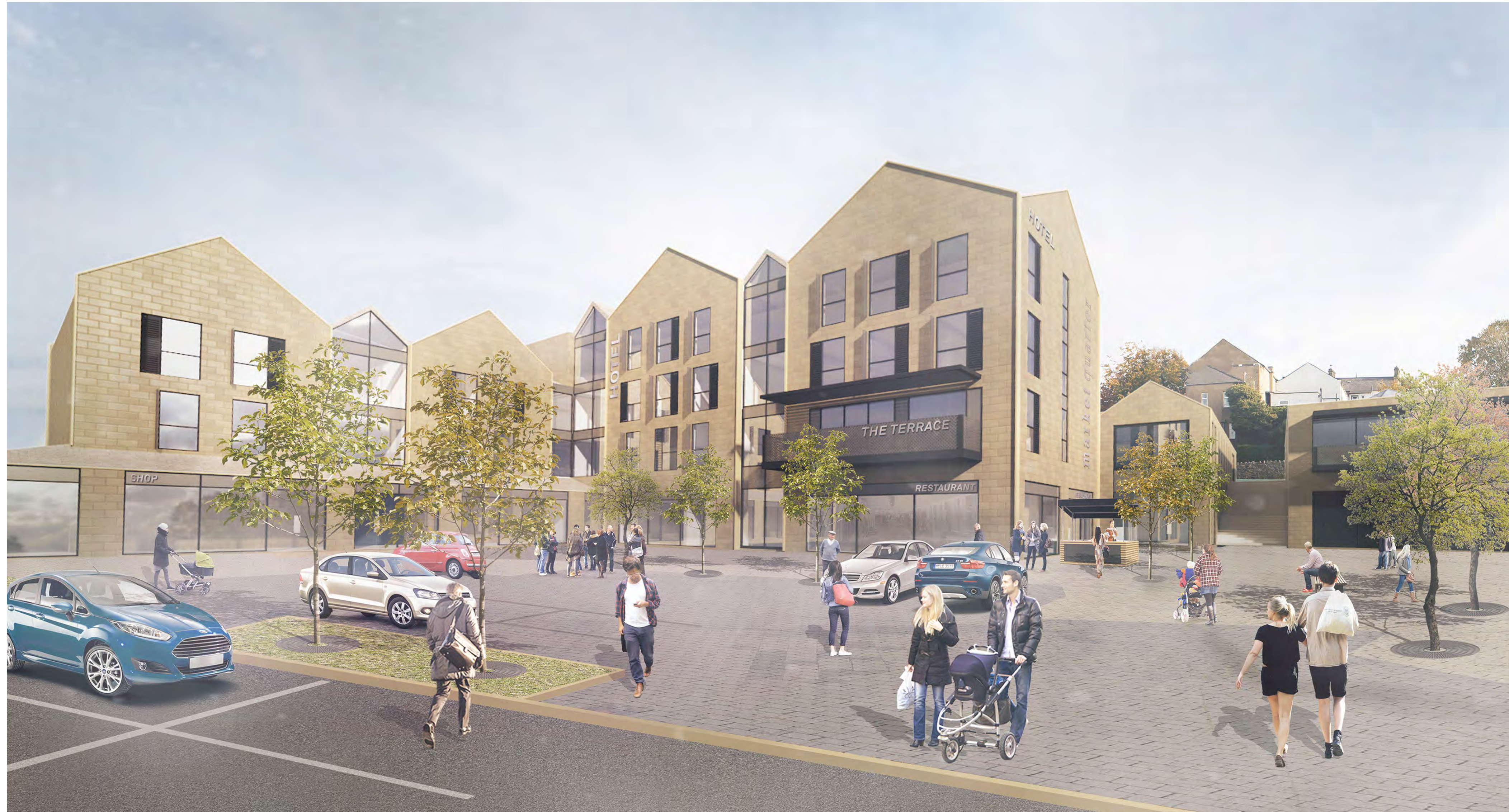
Illustration view to Finished Development