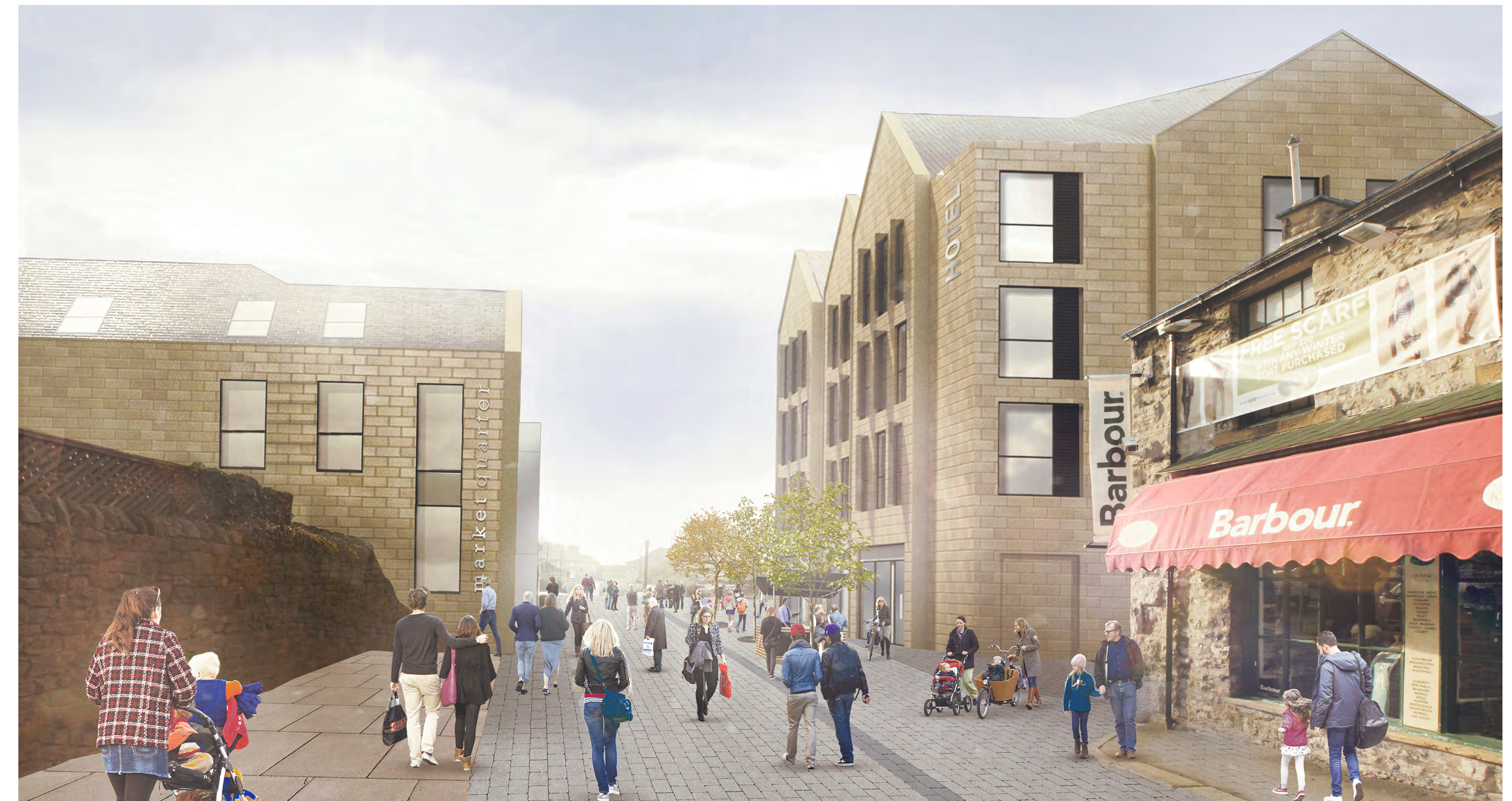
Tying the historic town together