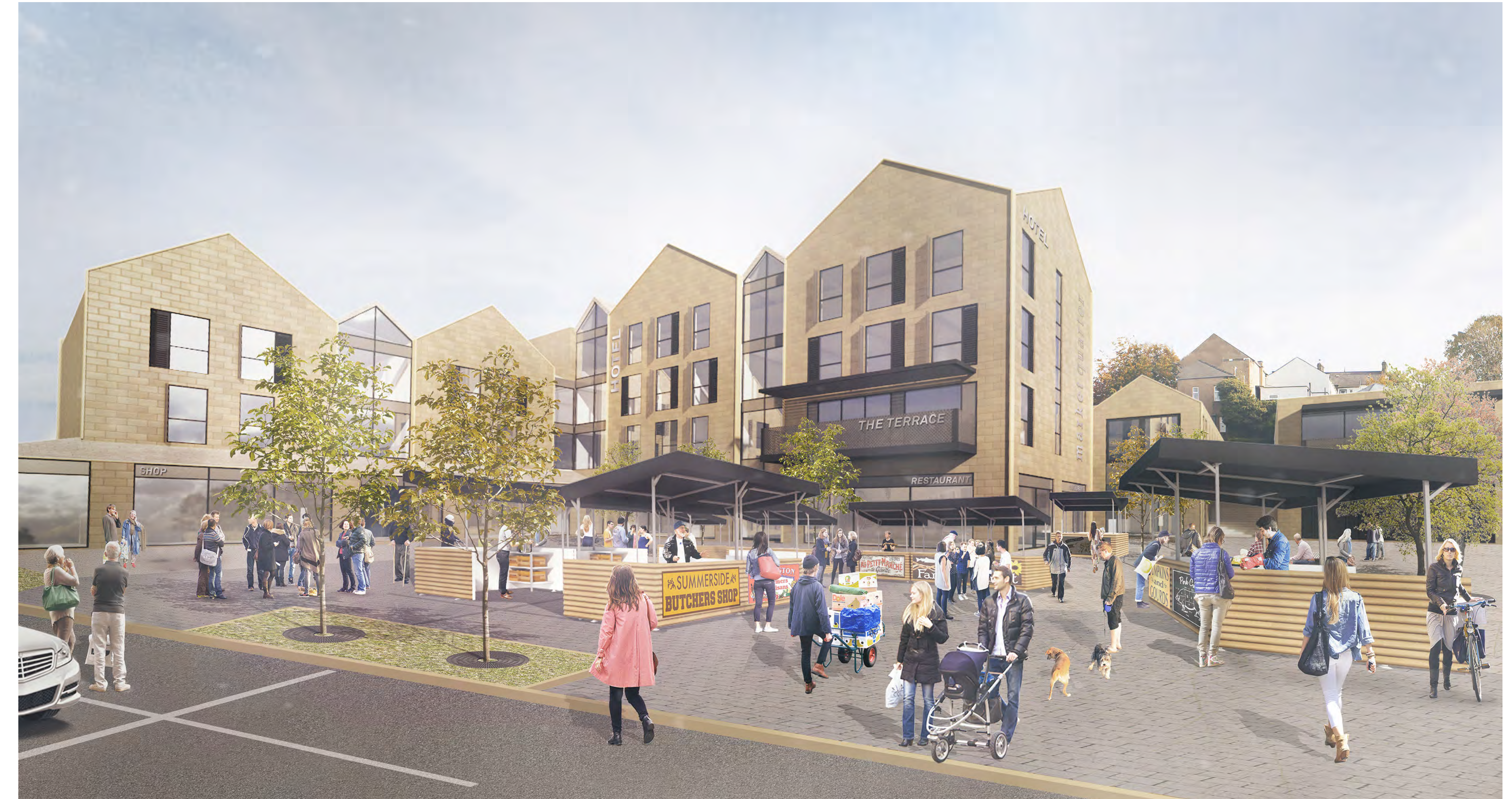
How an Artisan Market on Clitheroe Food Festival Day could use the new space