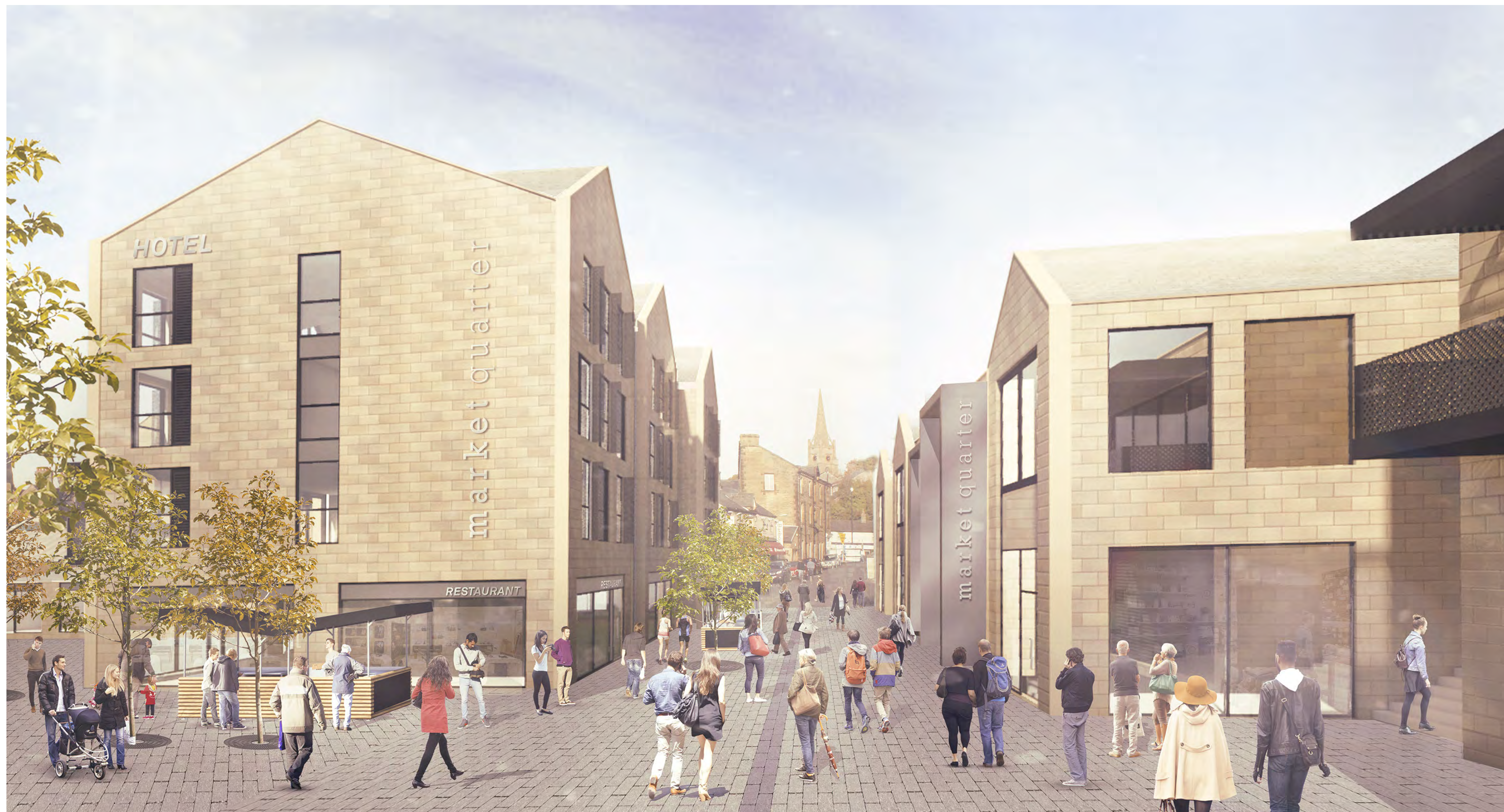
A view to the new Outdoor Market